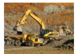
· Mobile Equipment