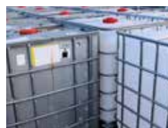
· IBC & Fluid Tank