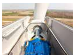
· Industrial Gearbox