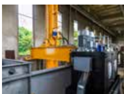
· Hydraulic Reservoir